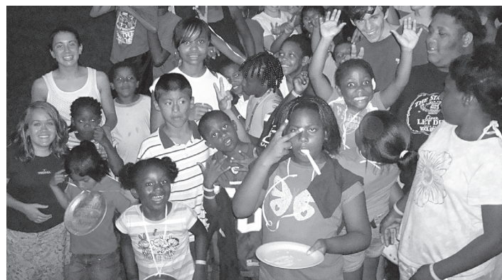
continued on page 4

Conversations that emerged from these talks helped the team to process the way the week could affect their life choices on a broader scale and how to better love one another.